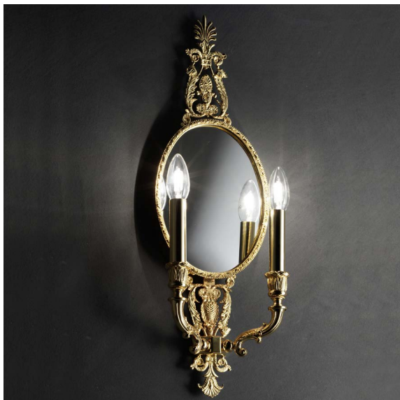
VE 1077 A2