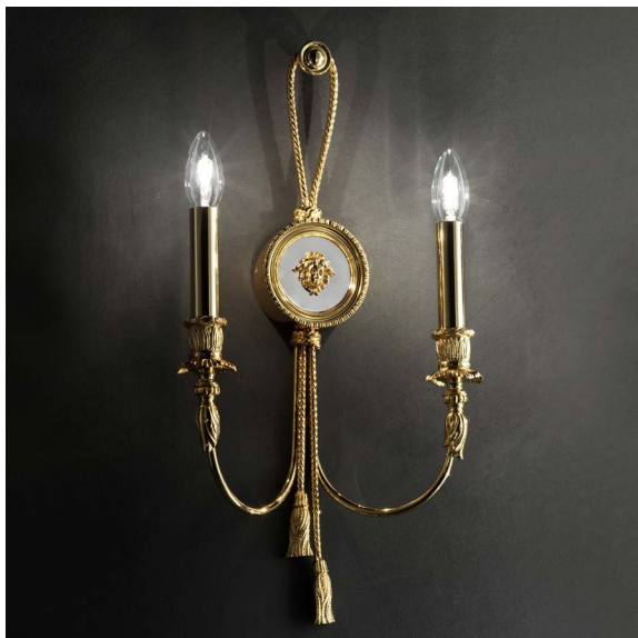
VE 1071 A2